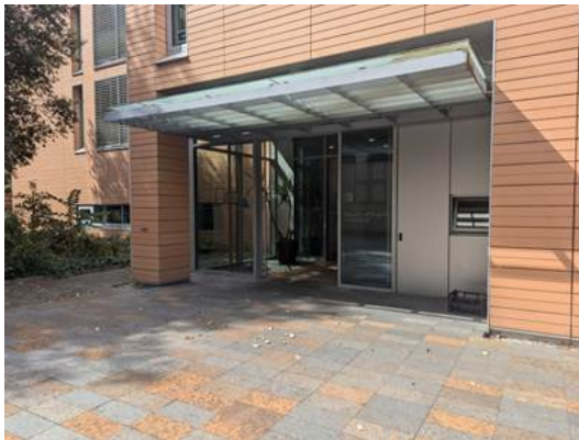
English Faculty entrance

The entrance to the English Faculty building is on the East side of the building, off of West Road. There will be a member of event staff to greet you in the foyer each morning of the conference.